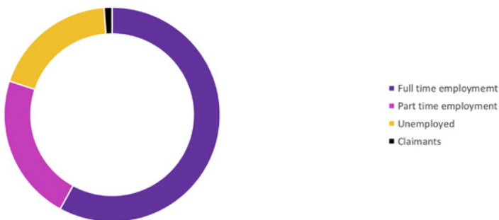
This chart illustrates the categories of employment in Worcester.